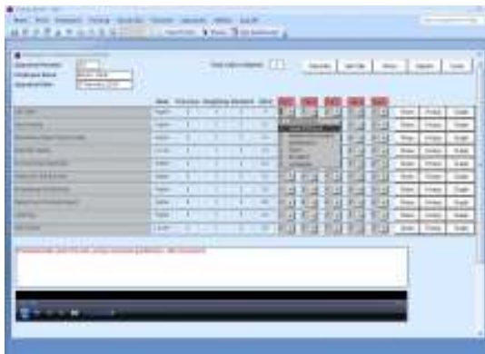
Integration with the recorder allows a random selection of calls to be assessed against predetermined skills and competencies. All designed to allow quick and efficient assessments.

4. Provides formatted and concise appraisals quickly and efficiently. QE2 removes the hassle and time to produce a printed report. This reduction in time and resources means a more efficient work force, where action to ensure the best quality service can be taken without delay, improving productivity and freeing contact centre manager's time.