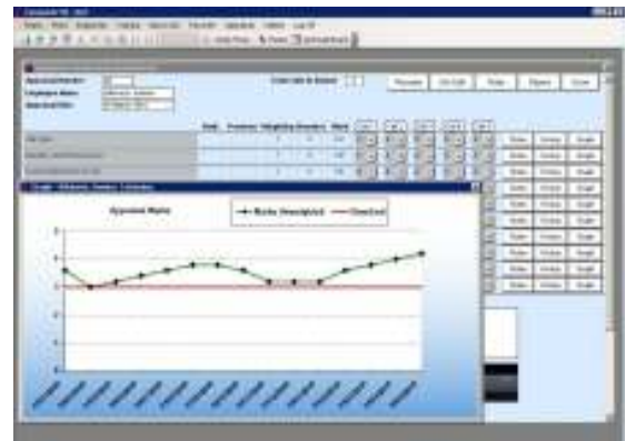
The ability to see overall assessment results over time with drill down to individual skills allowing quick pinpointing of training requirements.