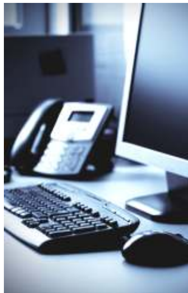
Record conversations onto your computer

REALCORDER USB is easily installed on any customer-supplied desktop host computer. It works independently of the PC sound card system - this means that any inadvertent changes made to the PC sound card settings or software will not affect reliability or sound quality.